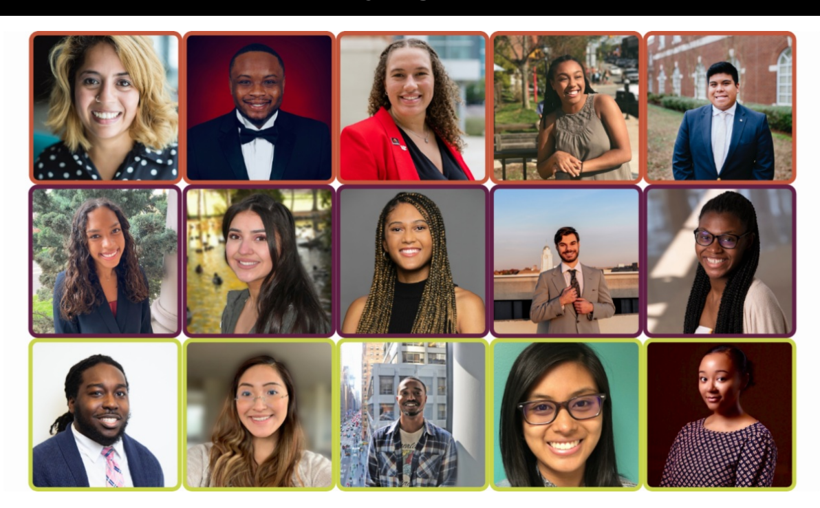
Students and rising professionals placed by TLF

In 2021, <u>The LAGRANT Foundation (TLF)</u>, in partnership with its donor partners, placed more than 50 students and rising professionals to varying opportunities across the country. Individuals were placed in temporary, internship and full-time roles. TLF-affiliated individuals retained by the Foundation's donor partners include: